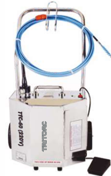
TTC-60 - Tube Cleaner