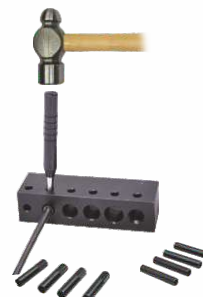
Shaft Repair Tool