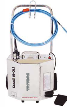
TTC-40 - Tube Cleaner