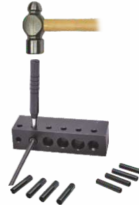
Shaft Repair Tool